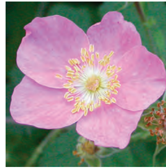
Rose varieties with fewer petals, like the native Rosa californica, grow better in cool summer areas.