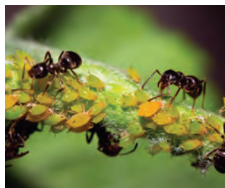
Ants are attracted to the honeydew that aphids make.

Aphids (and other plant pests including whiteflies and scale) produce a sweet, sticky substance called honeydew that attracts ants. Seeing a lot of ants on plant stems is a sure sign of a pest infestation. Since ants will actually protect honeydew-producers from natural predators, it's important to keep ants away when you're trying to get rid of aphids.