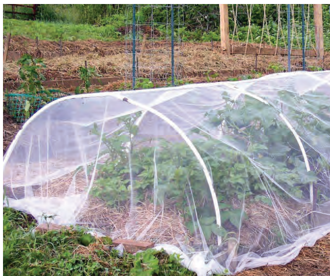
A row cover will keep aphids away from plants.