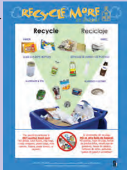
18" x 24" posters

These 8.5" x 11" and 18" x 24" recycling posters will bring both education and color to your classroom!