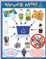
8.5" x 11" posters

Have you seen our brand new recycling posters?