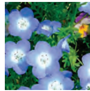
Baby blue eyes

These plants are rich in pollen and nectar, and will attract beneficial insects and pollinators—like bees and butterflies.