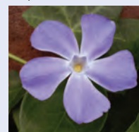
Periwinkle Vinca major