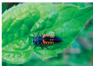
Juvenile ladybug (larva)