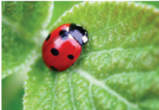
Lady beetle (ladybug)

Beneficial insects are the ultimate non-toxic pest control. And they do all of the work for you! Soldier beetles, syrphid flies, and ladybugs and their larvae attack aphids. Lacewings will go after just about any insect pest.