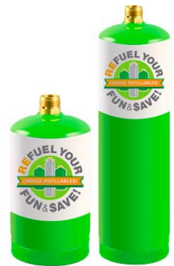
ReFuel Your Fun branded refillables