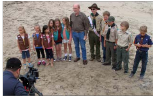
PSA filming at Natural Bridges State Beach