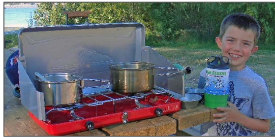
Camping stove fueled by refillables