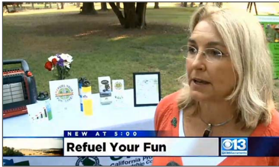
Good Day Sacramento feature